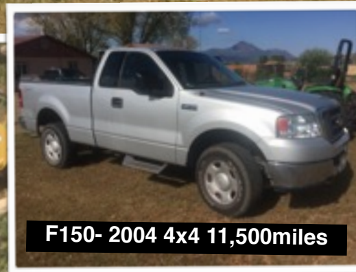
F150- 2004 4x4 11,500miles