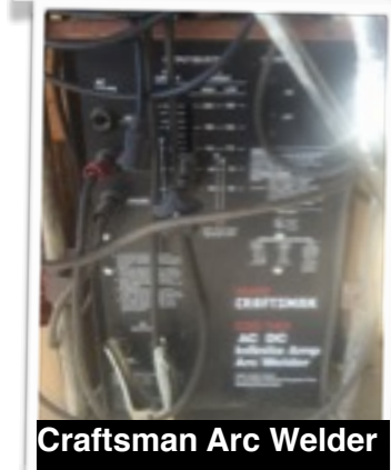
Craftsman Arc Welder