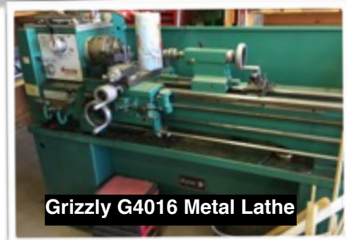
Grizzly G4016 Metal Lathe

Payment is due at time of purchase. Cash, Business Check or Credit Cards are accepted. Auction company is a commission agent only, not responsible for accidents or property. Items must be paid for and loaded out day of sale. Announcements made day of sale take precedence over flyer.