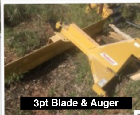
3pt Blade & Auger