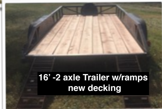
16' -2 axle Trailer w/ramps new decking

Craftsman tools like new, ladders, socket sets, power tools, 2500 psi pwr washer, riding mowers w/att. hydraulic press, bandsaws, air ratchets/hammer, tap & dies, freezer, cement mixer, new tires, tool boxes, windows, t-posts, wood chipper, survey laser, fencing/chargers, weed trimmers, chainsaws. plus LOTS, LOTS MORE!!!!